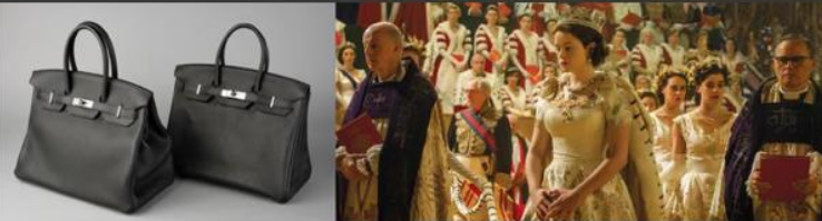
Counterfeit Birkin bag and film still of "The Crown" courtesy of the Winterthur Museum

*Lunch available for purchase at the Garden Café or the Cottage Café